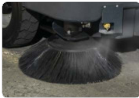
DustGuard™ suppresses airborne fugitive dust where most dust is generated – at the side brooms