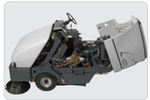
MaxAccess™ allows faster repairs and less downtime so the sweeper spends less time in the shop and more time sweeping