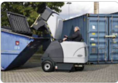
Variable dump height of up to 62 inches allows fast and simple disposal of swept debris