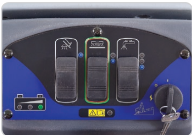
The ST 26 inch disc model – provides simple operation and robust scrubbing controls.