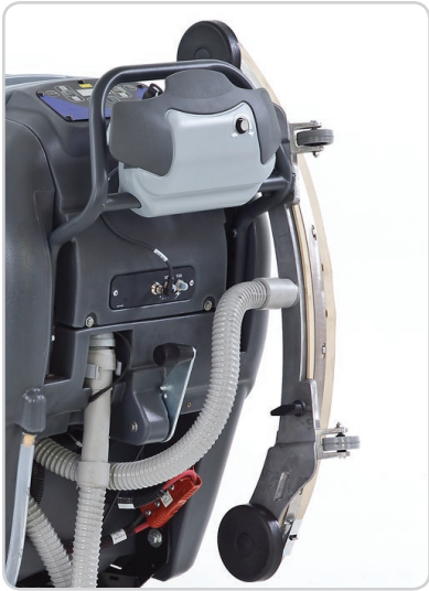
A built-in squeegee hanger makes transport easier and reduces trip and fall accidents.