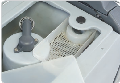
An integrated debris catch cage traps and collects drain clogging debris.